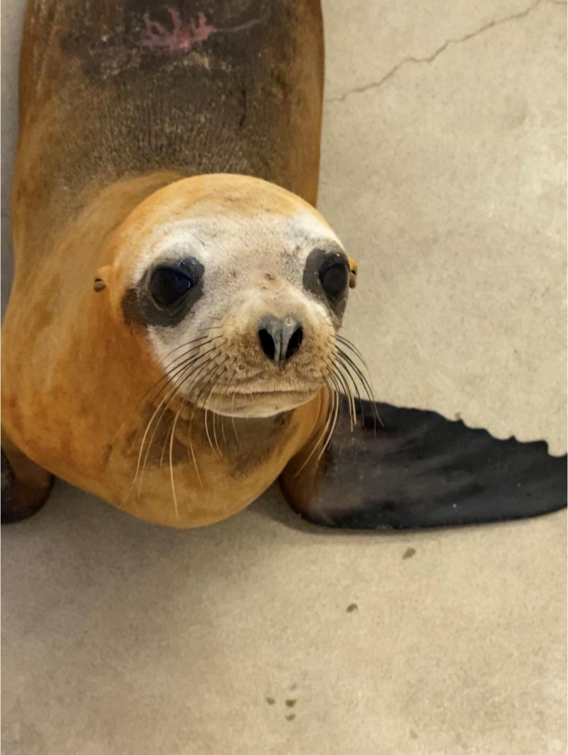
Mandalorian after rescue.